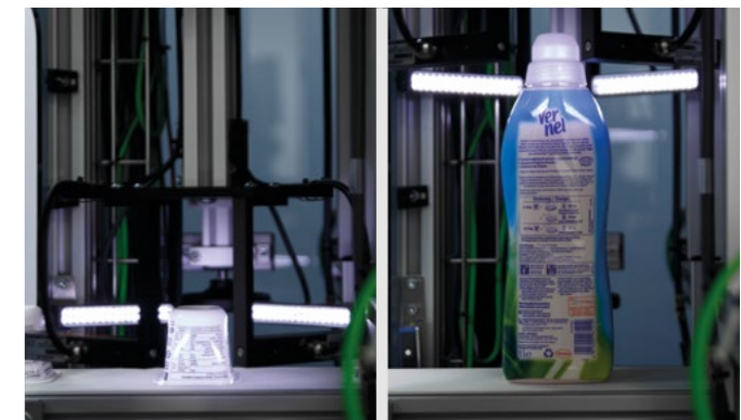
Flexible adjustment to a great variety of object sizes

Special products require special solutions. We will be pleased to customize your SleeveWatcher with additional cameras, lightings and inspection modules, to ensure that no corner of your product remains uninspected and no production defect is missed.