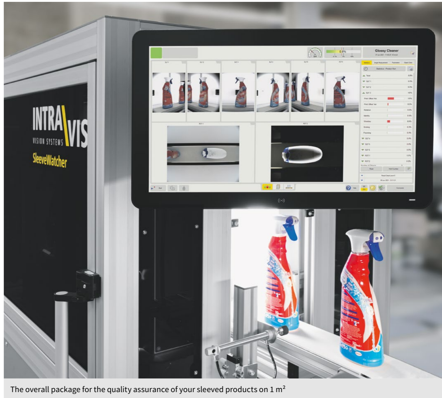
The overall package for the quality assurance of your sleeved products on 1 m 2