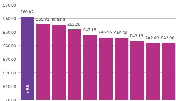
Figure 1 An example of nBS's success with the WSCC asset; achieving a £60.42 availability price in TR118, the highest in 2019.

The asset has also delivered as expected in support of stability of the network. This was most apparent during the large national power outage on 9 August 2019, with a loss of generation of nearly 1,700MW, when the asset responded within two seconds to help reduce the sudden shortfall in supply.