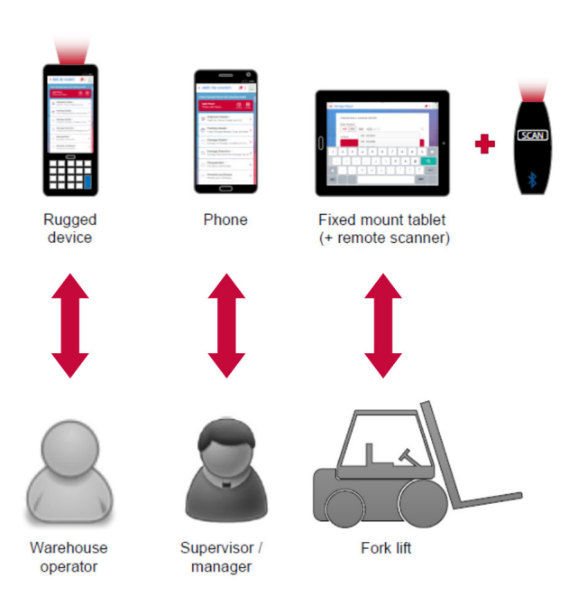
More Devices = More Options

Finally, these devices have become more powerful – allowing more complex apps to work harder and simplify life for the user. Automatic detection of data types from scanned data, automatic verification of user actions in real time and features, like barcode, QR, and address scanning that have become standard in consumer smartphone apps can be applied to the business environment.